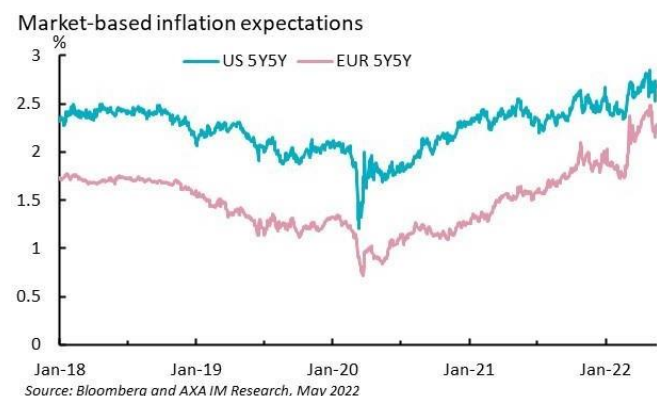
Exhibit 3 – More an issue for the ECB than for the Fed