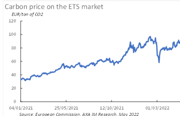
Exhibit 2 – Moving back from the right threshold

In a joint Op Ed with Bertrand Badré in Project Syndicate a few weeks ago we made the point that while the imperative of taking on board energy security concerns could justify some short-term drift in carbon emissions – e.g., because Liquefied Natural Gas emits more GreenHouse Gas (GHG) per calorie than ordinary natural gas – any strategy to wean the EU off Russian energy had to preserve the long-term imperative to get to “net zero in 2050”. In clear, the short-term drift would have to be offset by less emissions than initially expected in the medium term. Releasing unused emission permits would send the wrong signal, because lower carbon price today affects carbon emissions tomorrow. Corporates and financial institutions need a clear price signal to be able to accurately allocate capital towards decarbonization. An instrument to reduce its volatility – more signal, less noise – as the MSR will help, and it may become at times necessary to stop carbon pricing to overshoot the equilibrium level consistent with net zero by 2050. A too high price of carbon could end up being so immediately crippling for energy companies that their financial capacity to invest in the transition could be curtailed. But creating the impression that emission permits would be seen by public authorities more as a source of funding than as a way to create the right incentives for cleaner production could distort this price signal.